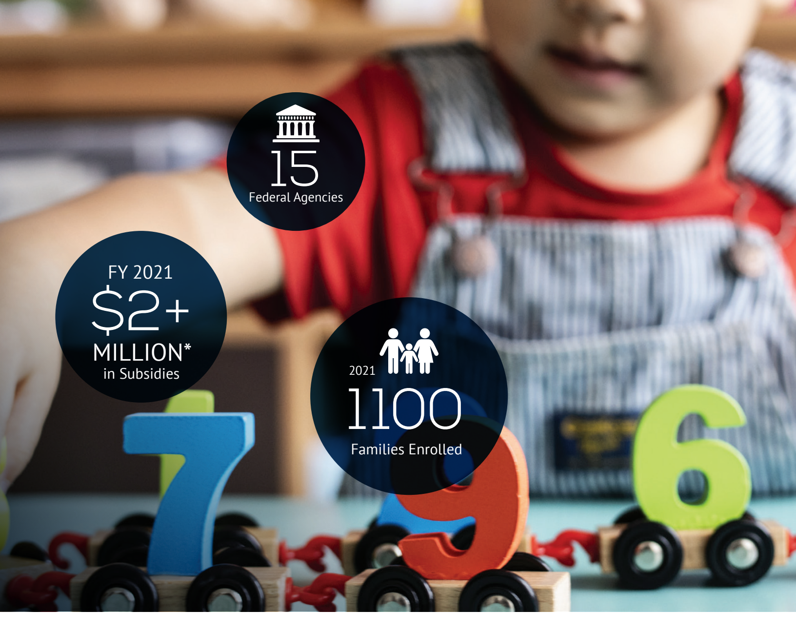
*For FCCS FY2021 (May 2020 to April 2021). Although many childcare centers and summer camps were closed at points throughout the early part of the pandemic, FCCS still provided over $2M in subsidies to those federal employees whose childcare providers were open to essential personnel or later opened for service.